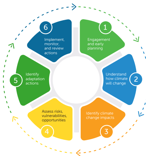
Figure 1: Adaptation planning cycle (Adapted from: climatedata.ca/news/harnessing-climate-data-for-resilient-asset-management/ )